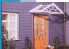
Glazing and sealing applications on windows and doors made of all common materials