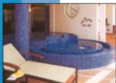
Also suitable for connection joints in the bathroom area