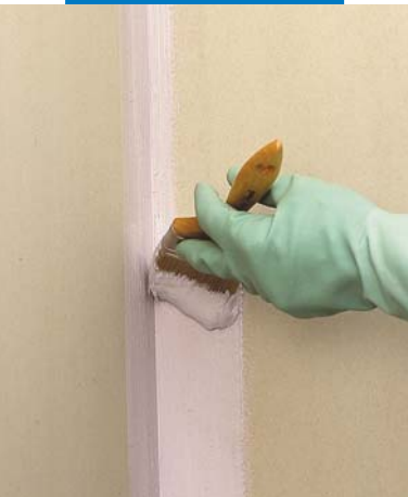
Applying Mapegum WPS with a brush