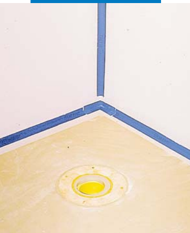
Bathroom wall waterproofed with Mapegum WPS and Mapeband