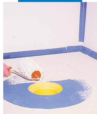
The special piece of Mapeband embedded in the Mapegum WPS