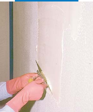
Spreading a coat of adhesive on Mapegum WPS