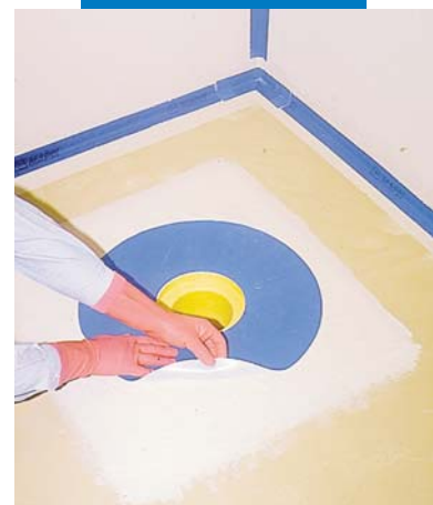
Positioning the special piece of Mapeband over Mapegum WPS

Mapegum WPS is available in 5, 10 and 25 kg drums.