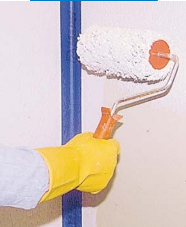
Applying Mapegum WPS on a wall with a roller