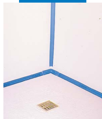
End result of a waterproofing treatment using Mapegum WPS and Mapeband