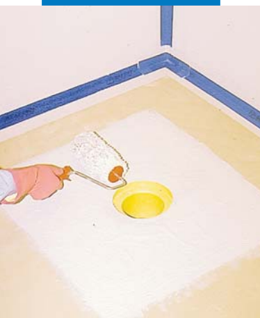
Spreading Mapegum WPS around the drain in a shower cubicle